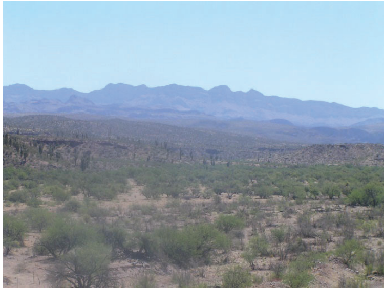
Figure 1. Redfield Canyon Wash

surface water connection to any body of water. Under the agencies' standards that have historically prevailed, it nonetheless is a "water of the United States."