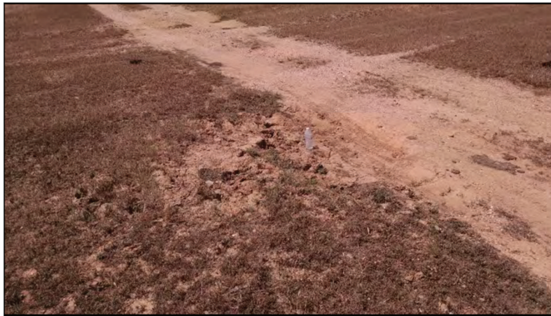
Figure 3: A small depression on a dirt road

More examples abound, illustrating just how far the federal government has strayed from the textual limitation of its jurisdiction to "waters of the United States." In recent years, the Corps has asserted jurisdiction over: