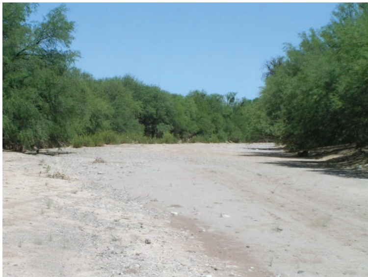
Figure 2. The San Pedro River