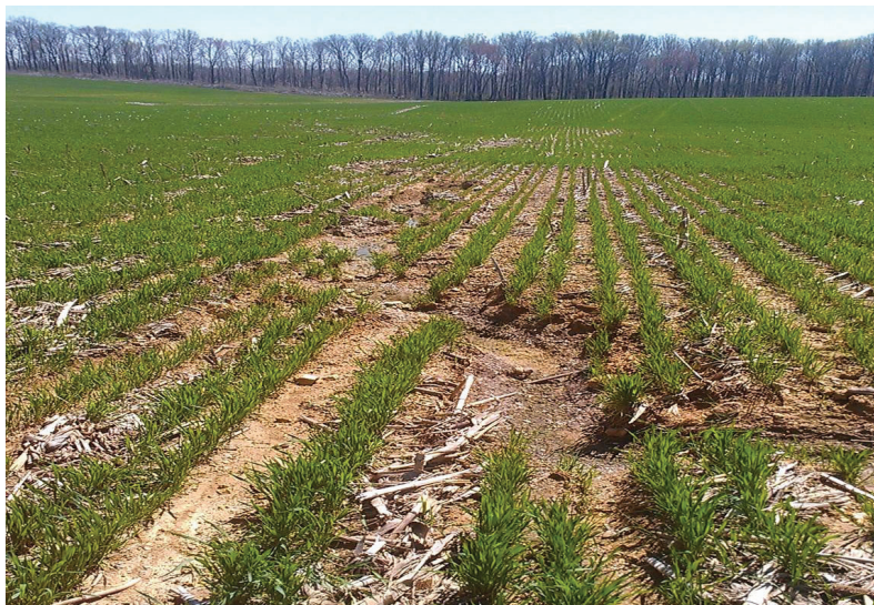
Figure 7. A ditch exhibiting an ordinary high water mark

The practical costs of the federal government’s over-reaching cannot be overstated. Once a feature has been deemed a “water of the United States” subject to federal