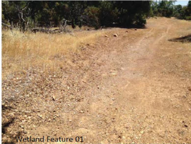
Wetland Feature 01