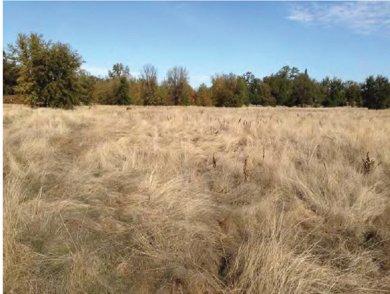
Figure 6. Pits dug to test soil percolation