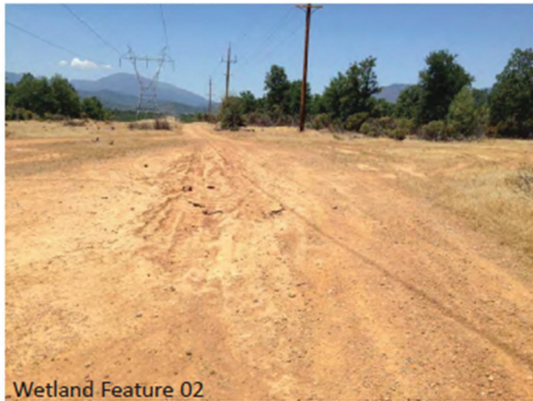
Wetland Feature 02