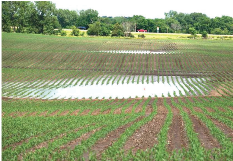
Figure 8. Small “depressional wetland” or puddle?

Even absent a definitive determination of CWA jurisdiction, the prevailing regime has had a tremendously costly chilling effect on land use in light of the vagueness of the applicable standards. Consider this photo: